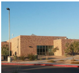
Marana School District Pima County