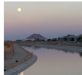
Tucson Water District Central Arizona Project

Before investing in the Fund, carefully read about and consider the objectives, risks, charges, expenses, and other information found in the Fund prospectus. The prospectus is available from your professional financial advisor, and when you call 800-437-1020 or visit www.aquilafunds.com .