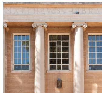
Arizona State University, Tempe