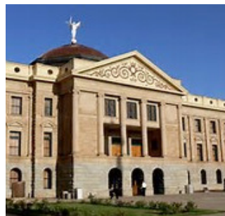
Arizona State Agencies