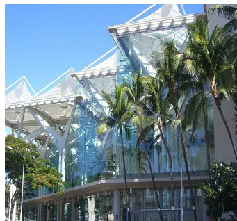
State of Hawaii Convention Center, Oahu

In addition, your investment in Hawaiian Tax-Free Trust may directly benefit your state, your county, and even your community by financing important local projects. Hawaiian Tax-Free Trust invests primarily in tax-free municipal obligations of Hawaii issuers; securities that finance schools, highways, hospitals, water and sewer facilities, and other projects in Hawaii, examples of which are pictured here. 2