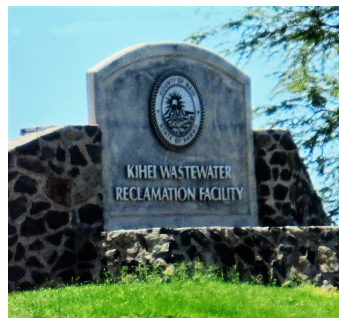
Kihei Wastewater Reclamation Facility, Maui