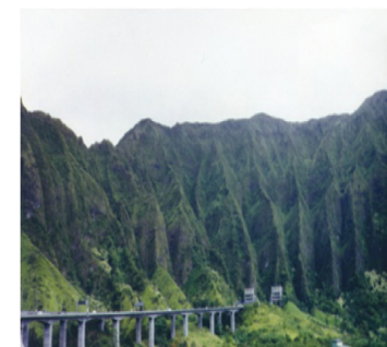
Hawaii Interstate H-3 Highway, Oahu

Before investing in the Trust, carefully read about and consider the objectives, risks, charges, expenses, and other information found in the Trust prospectus. The prospectus is available from your professional financial advisor, and when you call 800-437-1020 or visit www.aquilafunds.com .