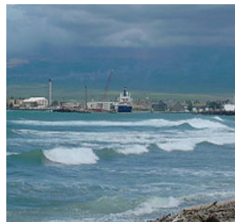
Kahului Harbor Maui