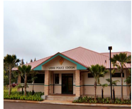
Lanai Police Station Lanai