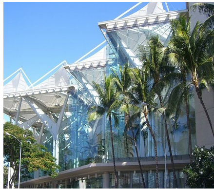
State of Hawaii Convention Center Oahu