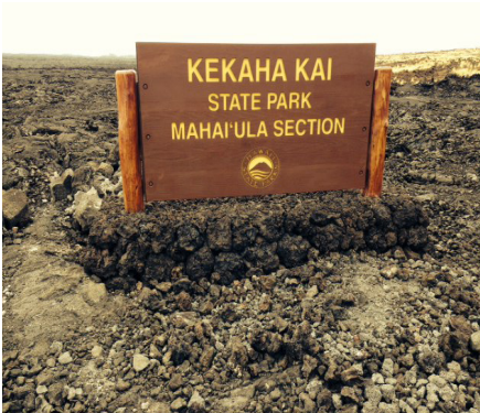
Kekaha Kai State Park Kauai