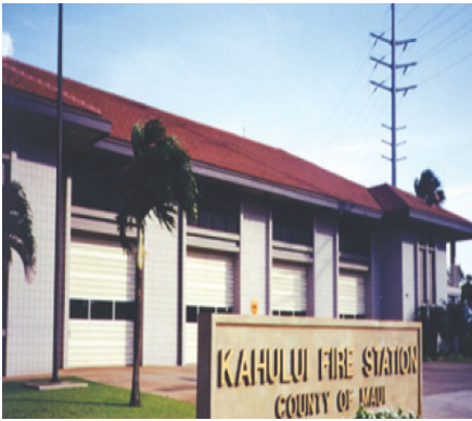
Kahului Fire Station Maui

Hawaiian Tax-Free Trust is a mutual fund which seeks to provide as high a level of current income, exempt from both State of Hawaii and federal income taxes, as is consistent with preservation of capital. 4 To achieve this objective, the Trust invests primarily in tax-free municipal obligations of Hawaii issuers; securities that finance schools, highways, hospitals, water and sewer facilities, and other projects in Hawaii, examples of which are pictured here. 5