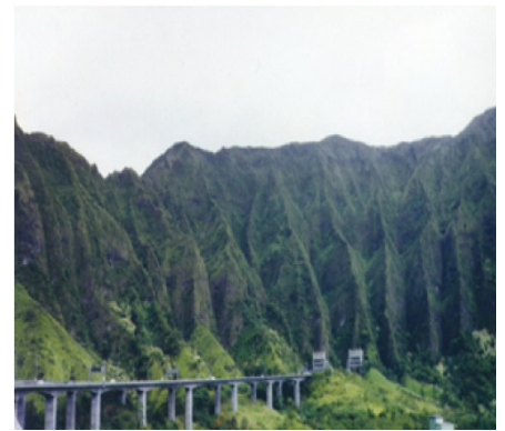
Highway 3 Oahu