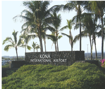
Kona International Airport Big Island of Hawaii